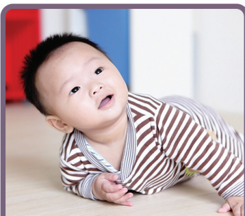
SERVICES for INFANTS/TODDLERS

If you are new to Cuyahoga DD or are uncertain about your eligibility status, please contact us at 216-736-2673 or Intake@CuyahogaBDD.org .